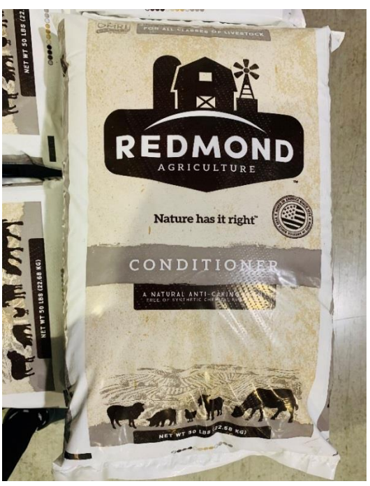
Redmond Conditioner benefits

The Redmond Conditioner is an all-natural organic mineral blend that contains many benefits. Redmond Conditioner includes 60+ minerals, it is a toxin binder, rumen buffer, and controls ammonia. Since it has all these properties in just one bag it saves the farmer money and simplifies the farmer's life at the same time. Redmond conditioner reduces the feed costs as it's less per cow, per day than conventional mineral programs. Also reduces vet bills as cattle on this mineral are healthier and have less mineral deficiencies. Many studies show that Redmond Conditioner improves conception rates and milk production. The chart below compares Redmond Conditioner to bicarb and how they both act the same as a buffer, but Redmond comes with way more benefits than bicarb can.